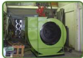
Industrial Fans Design