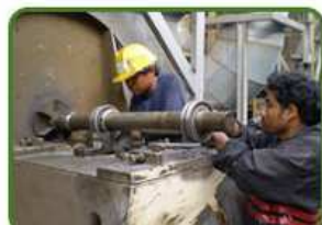
Onsite Fabrication & Service