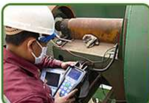
Vibration & Field Balance Onsite