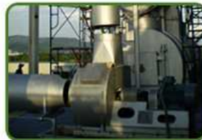
High Temperature Fan (600-1,200c)